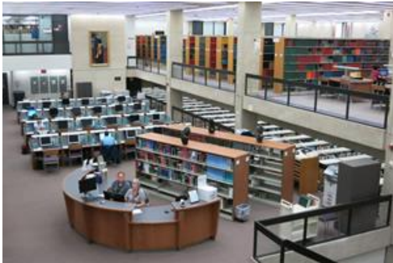
George F. Smith Library